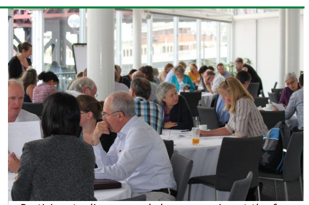
Participants discuss workshop scenarios at the forum

The NSW Roadside Environment Committee (REC) hosted the NSW Linear Reserve Environmental Management Forum in Sydney on Tuesday 30 October 2012 at the Australian National Maritime Museum, Darling Harbour, Sydney. The forum provided an opportunity for land managers and other interested people to learn and discuss operational and strategic issues facing linear reserves in NSW.