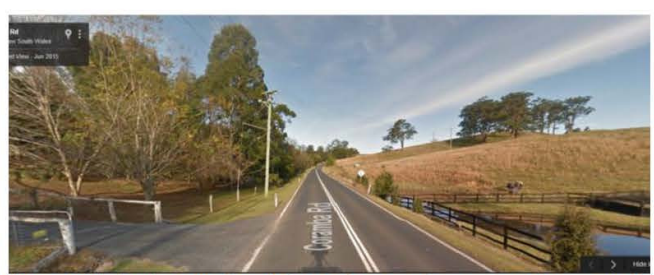
Figure 2 This is where we found the turtles. Google maps says it was outside 1142 Orara Way, Karangi.

Many turtles are crossing roads, but some are not happy about it. On Saturday the ninth of April, my family were on our way back from Dairyville after my brother's soccer game. We came across five turtles near Poperaperan Creek Road on the Orara Way, Karangi. We stopped to get them off the road. Three were on the grass on the Coffs Harbour bound side of the road, one turtle was on the edge of the road about to cross and two were a quarter of the way across. A car ran straight over one of these turtles and it died straight away. The tyre also ran right over the other turtle's head and died minutes later. It was sad to see because Mum and I are animal lovers. My Dad put the other turtles back to the water so they wouldn't be run over as well.