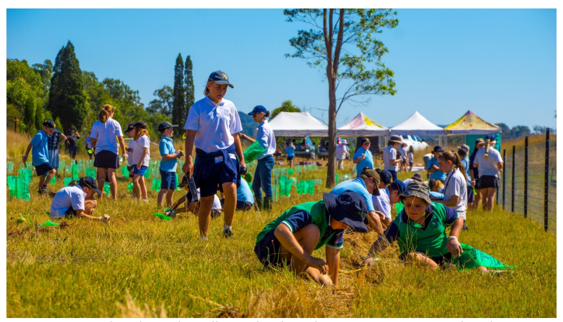
Merriwa Central and Sandy Hollow school students participating in the planting day held near the township of Gungal.

The partnership hopes to deliver further restoration projects of a similar nature in the future and will continue to engage new schools and the wider community in the process.