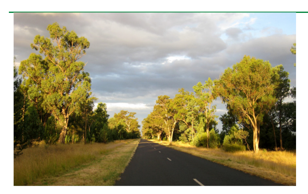
Lachlan Shire Council has produced a new Roadside Vegetation Management Plan Factsheet. Lachlan LGA is the largest in Central NSW, with an area of 15,000 \, \text{km}^2 and has approximately 4,000 \, \text{km} of roads.