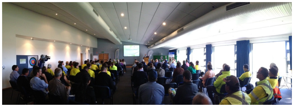
Approximately 100 people attended the Hollows for Habitat Forum in Orange.