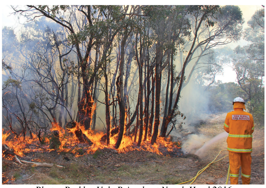
Photo: Berkley Vale Brigade at Norah Head 2016

The Bush Fire Environmental Assessment Code is a 'one-stop shop' environmental assessment and approval process for bush fire hazard reduction works.