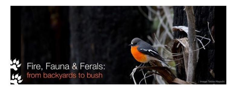
30-31 May, Conference: NSW Teachers Federation Conference Centre, Sydney

Nature Conservation Council's 2017 Bushfire Conference