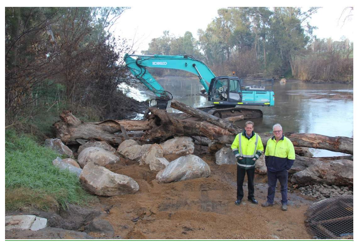
Works for the 'Comfortable Cod for Cowra' project